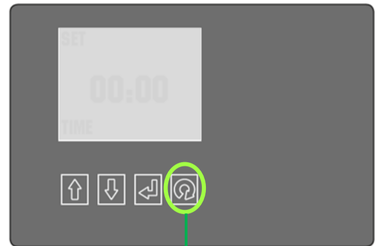
manual regeneration button