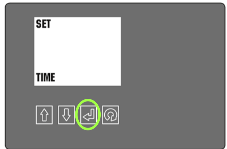
Diagram 2 required (normal display ) check manual